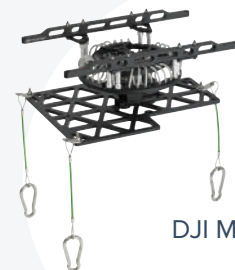
DJI Matrice 600